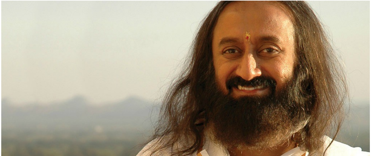
Photo of Sri Sri Ravi Shankar

The Art of Living Foundation is a volunteer-based, humanitarian and educational non-governmental organization (NGO). [1] It was founded in 1981 by Ravi Shankar . [2] The Art of Living Foundation has centers in more than 156 countries. [3] Art of Living offers several stress-elimination and self-development programs based on breathing techniques, meditation and yoga.